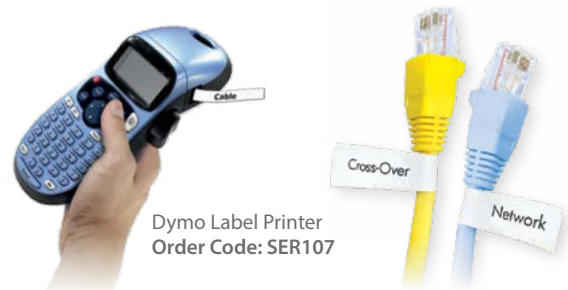
Dymo Label Printer Order Code: SER107

The Dymo label printer will keep your cables organised. It allows you to create labels to help quickly identify your tools and cables indicating what the different cables are used for; whether it's a networking cable, a cross over cable or your composite CCTV Cable. Label your cables and you can avoid having to trace indistinguishable cable back to their devices.