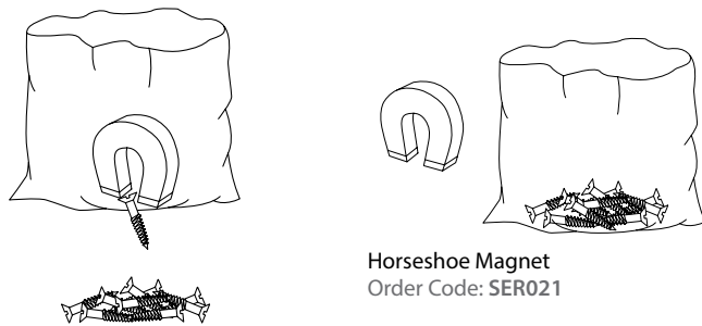
Horseshoe Magnet Order Code: SER021

So you've spilt a whole tub of screws on the floor, what do you do? Instead of picking them all up individually use a magnet inside a plastic bag so you can pick up multiple screws at once, then simply turn the plastic bag inside out to leave the screws inside the bag! Quick, simple and effective.